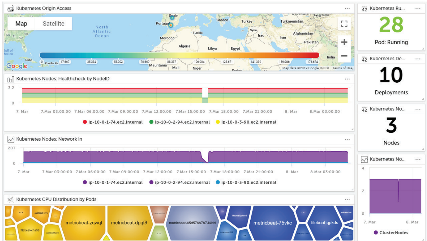
Figure 2: From raw data to expressive

An Activeboard can contain any number of drag-and-drop, customizable widgets. A variety of advanced chart-based widget types are available, including area, column, donut, heatmap, line, pie, and voronoi charts. Additional table and simple value widgets further allow you to display data in unique ways. Lastly, linked widgets allow you to pass a selected value to any number of other widgets and dynamically change the data being visualized.